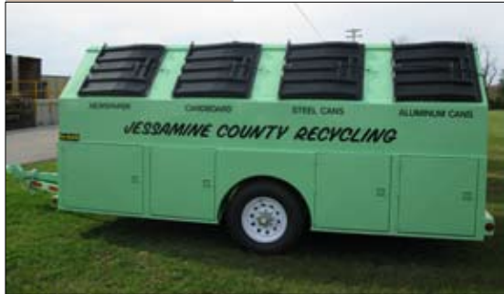
Recycling trailers are at seven locations throughout the county.

Recyclable material no longer needs to be sorted. It is simply loaded on a truck, taken to the Lexington Fayette Urban County Government Recycling