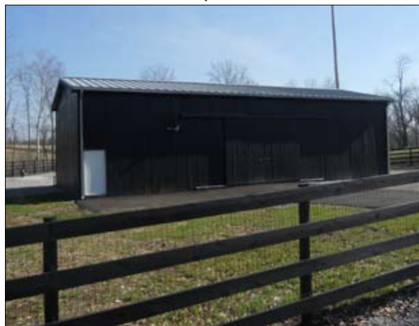
Newly completed Nicholasville Sewer Pump Station at 2351 Vince Road.

on public streets by providing an alternate route for buses to use between the two schools. Plans continue for the Kentucky National Football Players Hall of Fame and Youth Sports Field. The field will provide for additional recreational needs in the park. A date for the construction of the field has not been determined at this time.