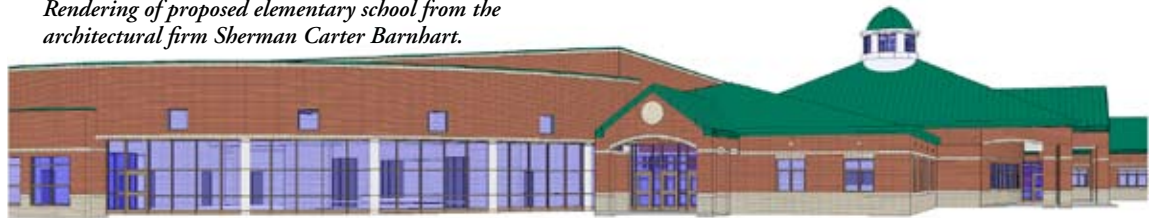
Rendering of proposed elementary school from the architectural firm Sherman Carter Barnhart.

That corporation markets the material and then distributes the proceeds to each participating county based on the amount of material sent by them to LFUCG Recycling Center. The funds returned to our county are helping to match grants for recycling trailers that are located at seven different businesses in Nicholasville and the County. These trailers are making it more convenient for residents to dispose of their items. For more information about recycling or other environmental programs, visit www.jessamineco.com or call 881-4545.