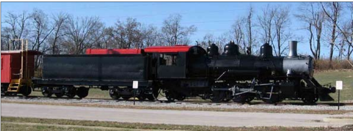
Engine Number 11 at Riney B Park. For more information about the RNI&B Railroad, or the train, visit www.georgeudean.com or become a friend of the Riney B Train on Facebook.