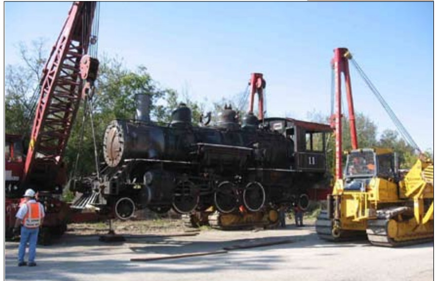
Engine Number 11 hoisted in air prior to being loaded for move to Nicholasville.

is amazing. That is why the train at Riney B Park is a valuable asset to our community. Once it is refurbished and promoted, it will bring hundreds of people to our park and will continue to do so as those who see it tell others. Studies have shown that each added community attraction enhances tourism. Every dollar spent by a tourist rolls over within the community about ten times. Tourism expenditures in Jessamine County in 2009 were estimated to be over $80,000, the fifth highest in the 15-county Bluegrass region. As I stated earlier, the Riney B now has a new role in our community. It is one that will benefit us economically, just as the first RNI&B locomotive named "Woodford" did when it pulled into the Nicholasville Depot October 4, 1890.