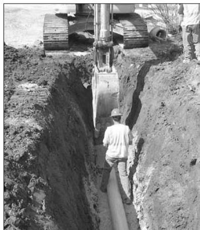
Funding from the State will support several new water lines and upgrades in the Fourth District.

The City of Nicholasville has awarded the construction contract for its long-awaited sewer project in the area of the Bluegrass Industrial Park. Construction has begun. It is scheduled to be finished sometime in the Fall of 2010. When completed this sewer project will