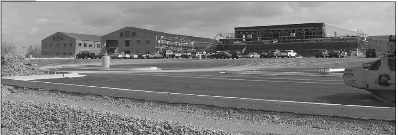
The new East Jessamine Middle School on Sulpur Well Road (KY-169) will be completed in time for students to begin the 2009 - 2010 school year.

Construction of the new East Jessamine Middle school began last year near the intersection of Union Mill Road and Orchard Drive. It is on schedule and should be open by August of this year. Future plans for the 85-acre site also includes construction of a new elementary school. Cost of the middle school is $25,000,000.00.