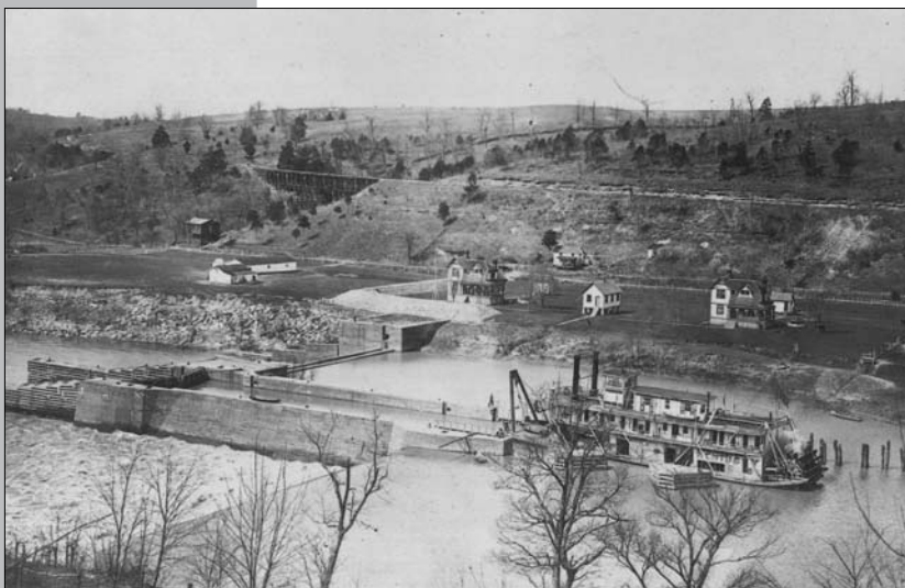
Originally constructed in 1924, Kentucky River Lock and Dam #9 near Valley View is slated for a major upgrade beginning this Spring.

Construction will begin this spring on a new dam across the Kentucky River at Lock 9. The structure will take two years to complete. A tremendous amount of equipment and materials will be delivered by truck for this project. Residents living on Camp Daniel Boone Road., or near Spears, need to use caution when driving in the area.