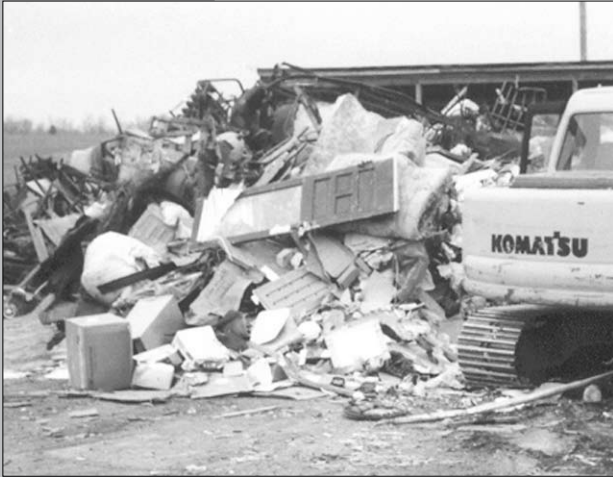
Do a little spring cleaning and take advantage of the County Wide Clean Up.

The County Wide Cleanup will be held the week of March 24-31. Residents are encouraged to take their trash and debris to the county garage, between 7:30 a.m. and 7:00 p.m., the week of cleanup. The county garage is located at the road dept. beside the City County Park, on Longview Drive. There will be no charge for disposal during that week. A fee will be charged for tires. Brush and storm debris will not be picked up or accepted at the county garage. Residents who are handicapped, or unable to deliver