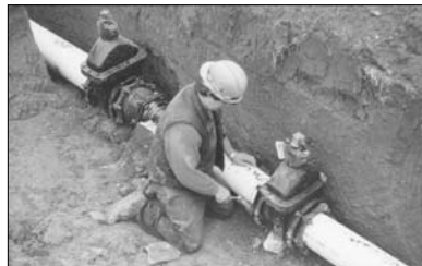
Funding from the State will support several new water lines and upgrades in the Fourth District.

Construction should begin sometime this summer, with completion 12-18 months later. I know many residents of the area are as anxious as I am to see trenches dug and pipes laid. I will continue doing everything I can to expedite the project.