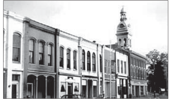
Nicholasville, Wilmore and Jessamine County firefighters worked together in an attempt to save this historic block in December 2004.